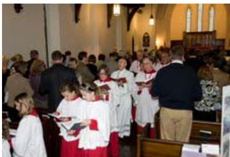
9 AM service on March 21, 2010

You can support this event in two ways: 1) by making a $10 donation for a luminaria – candle lantern lit by the track in memory or in honor of a loved one touched by cancer. (orders are due by April 19) 2) by purchasing a t-shirt bearing the slogan “ Nothing Could Be Finer than a Cure in Carolina. ” The shirts are navy blue with a palmetto tree and available in child or adult sizes, short sleeves ($15) or long sleeves ($20). Pictures can be found on the web site, www.RelayForLife.org/greenwood_sc Orders can be placed from now through the end of April. Contact Kim Russell at 864-943-0274 or at jahrussell@embarqmail.com about ordering a tee or a luminaria. Payment can be made at the time of the order.