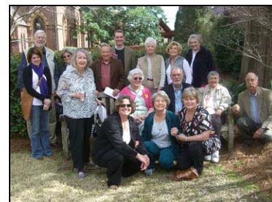
Primetimers trip to Augusta