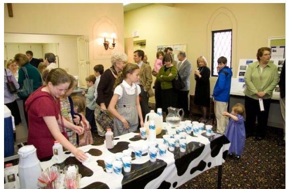
Breakfast on March 21, 2010

If you haven't already, you can sign up for your portrait session on Sunday, March 28, before or after each service (7:45, 9:00, and 11:15 AM.) Appointments are offered from 3 to 5:30 PM on Thursday, April 29 and Friday, April 30, and from 10 AM to 5 PM on Saturday, May 1. Portraits will be taken in Bishops' Hall and you will be able to select one for the directory at that time. Please note – there is no cost to participate in the directory. You will receive a complimentary 8x10 portrait and a FREE copy of the church directory for your participation (one per family).